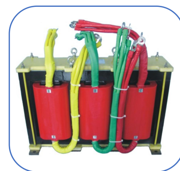
High-frequency Three-phase transformer