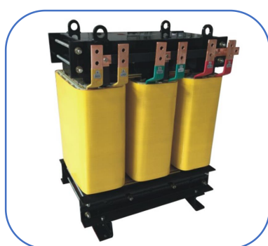
Three Phase Auto Transformer