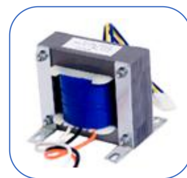
Single Phase Transformer