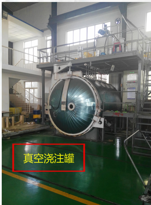
Vacuum Epoxy Potting Machine