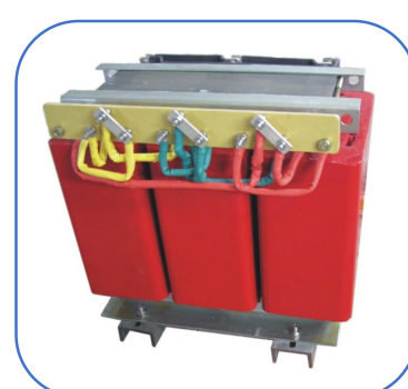
24 Pulse Epoxy Phase Shifting Transformer