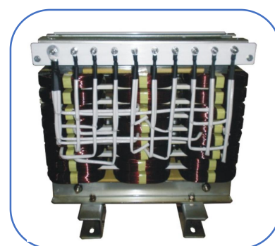
Three-phase inverter transformer