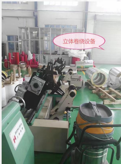
Stereoscopic Winding Machine