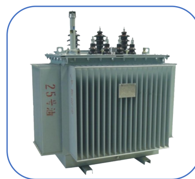
Oil immersed Power Transformer