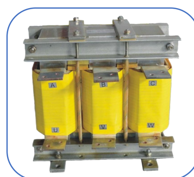
Three-phase Line Reactor