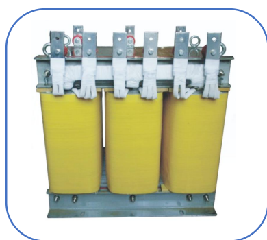
Three Phase Isolated Power Transformer