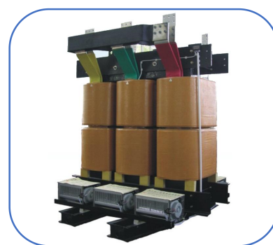
High-power inverter transformer